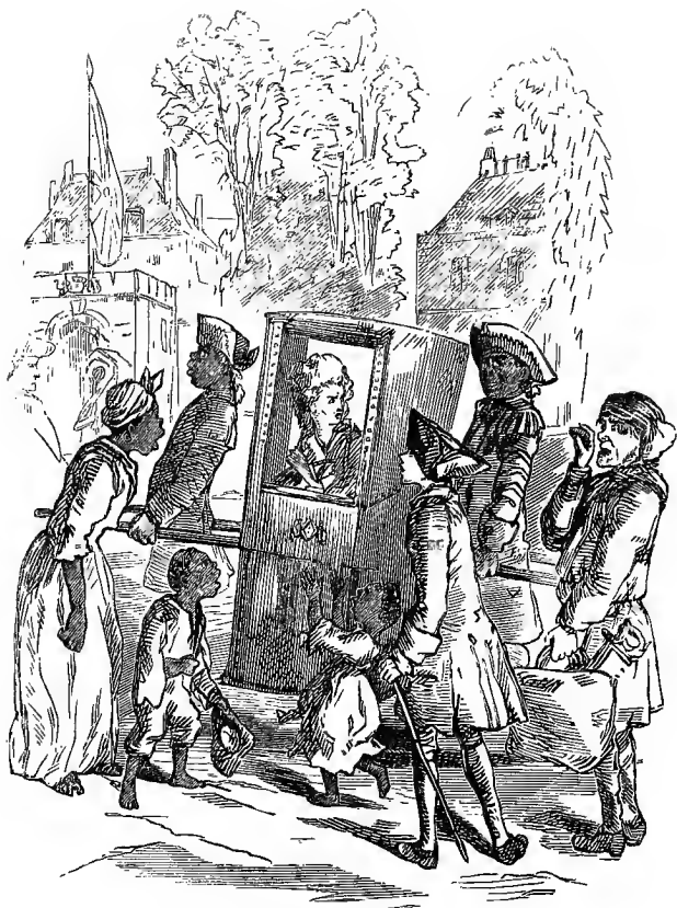
Arbitrium Popularis Auræ.